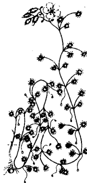
Drosera intricata Planchon

Note! If you are interested in obtaining tuberous Drosera that are not listed please inquire and/or request a "limited tuberous Drosera availability list" and their prices.